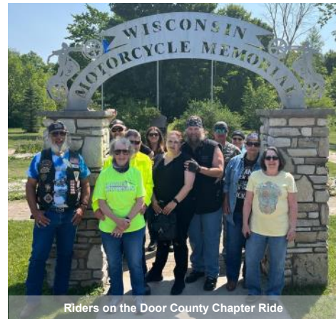
Riders on the Door County Chapter Ride

Greetings from Sturgis! I want to thank everyone who attended July's dinner rides — the Northeast and Door County rides. We made lots of stops and had even more miles ridden. We did dodge our share of rain.