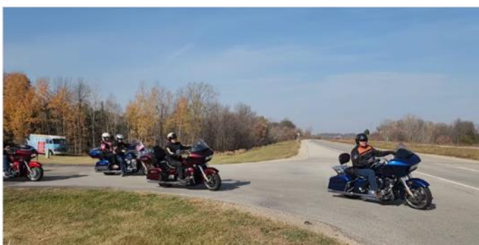
The Old Farts Ride took off from Doc's Harley-Davidson of Shawano County to enjoy the beautiful 80 degrees in late October! Come get lost with Roy.

Closed events are shaded in gray and are intended for Chapter members plus their guest. Non-designated rides are open to all.